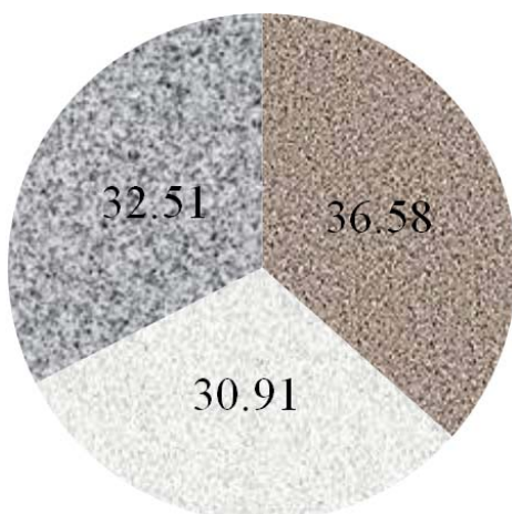
Fig. 1. Pie chart of the mean average.